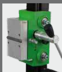
Universal tool holder